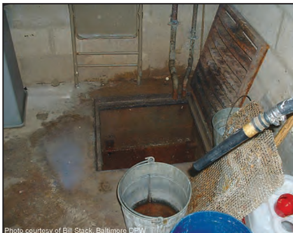
Figure 3: A common industrial cross connection is a floor drain that is illicitly connected to a storm drain

Non-target irrigation from landscaping or lawns that reaches the storm drain system: Irrigation can produce intermittent discharges from over-watering or misdirected sprinklers that send tap water over impervious areas (Figure 7). In some instances, non-target irrigation can produce unacceptable loads of nutrients, organic matter or pesticides. The most common example is a discharge from commercial landscaping areas adjacent to parking lots connected to the storm drain system.