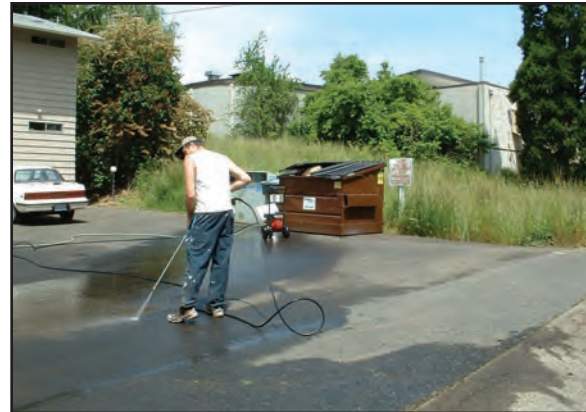
Figure 6: Routine outdoor washing and rinsing can cause illicit discharges