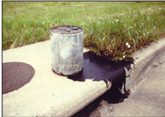
Figure 5: Dumping at a storm drain inlet