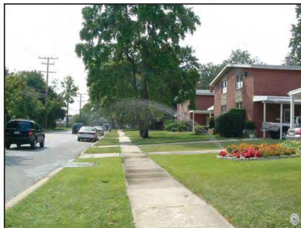
Figure 7: Non-target landscaping irrigation water