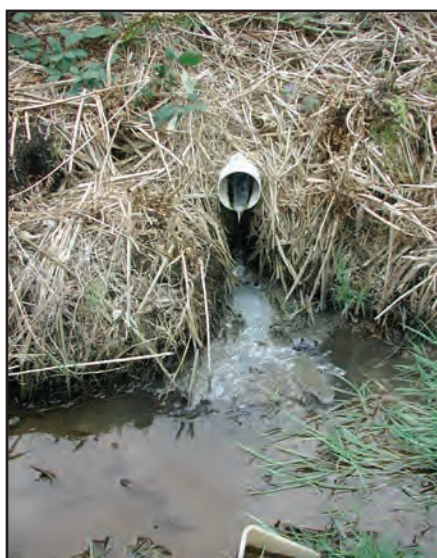
Figure 2: Direct Discharge from a Straight Pipe

Industrial and commercial cross-connections: These occur when a drain pipe is improperly connected to the storm drain system producing a discharge of wash water, process water or other inappropriate flows into the storm drain pipe. A floor shop drain that is illicitly connected to the storm drain system is illustrated in Figure 3.