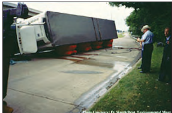
Figure 4: Accident spills are significant sources of illicit discharges to the storm drain system